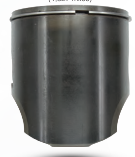
NO PISTON RING STICKING NO PISTON SCUFFING