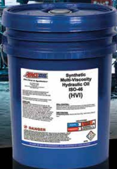
SYNTHETIC HYDRAULIC OIL