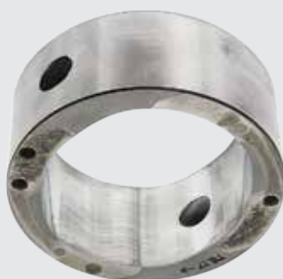
VANE PUMP CAM RING

Order by Phone 1-800-956-5695 - Give Operator Reference #5510465