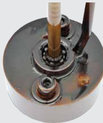
LEADING CONVENTIONAL HYDRAULIC FLUID (ISO 46)