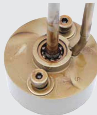
AMSOIL SYNTHETIC MULTI-VISCOSITY HYDRAULIC OIL (ISO 46)