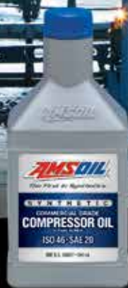
SYNTHETIC COMPRESSOR OIL